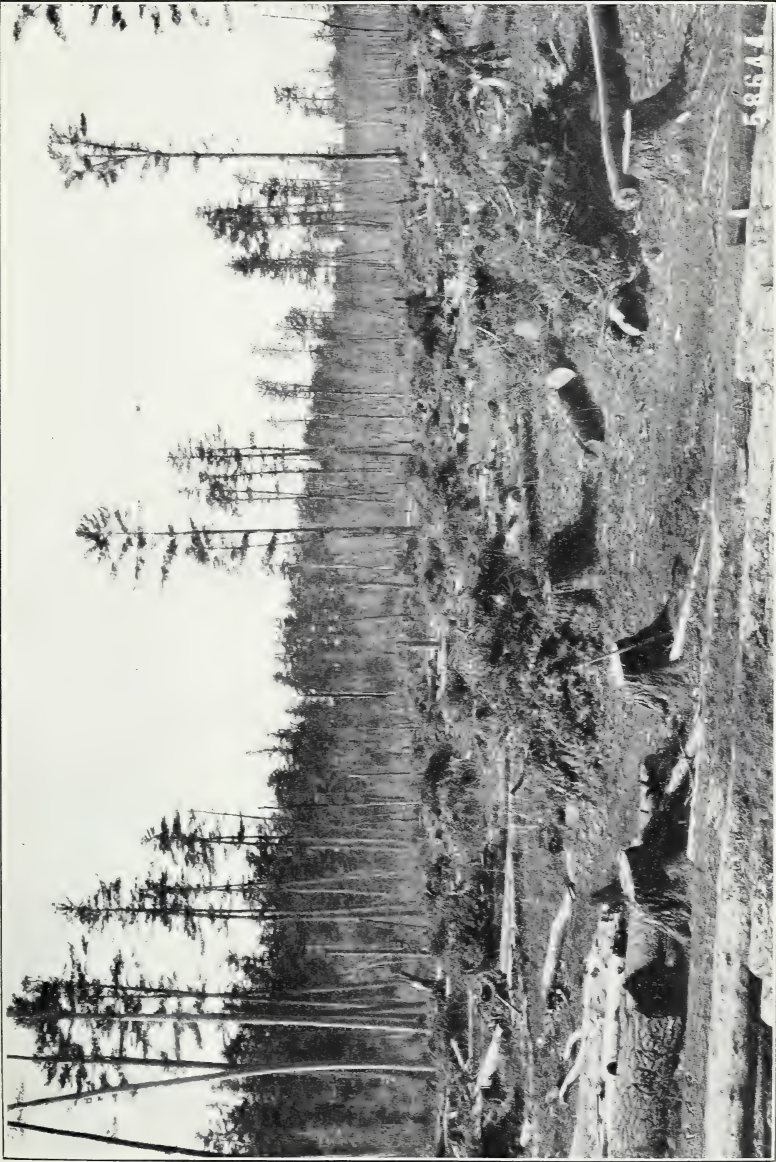
BRUSH PILED FOR BURNING; CLEAR CUTTING, LEAVING 5 PER CENT OF THE STAND FOR SEED TREES. MINNESOTA.